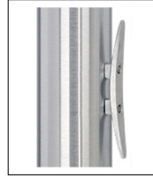
CLA-9090-SAT | 9' from bottom Cleat Only