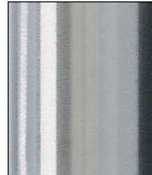
SAT Satin Finish