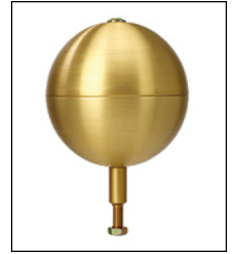
BAL-0812-GLD HD Gold Anodized Aluminum Ball