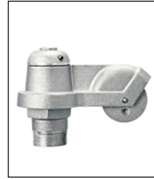
TRK-9610 In-Line Truck Single Revolving