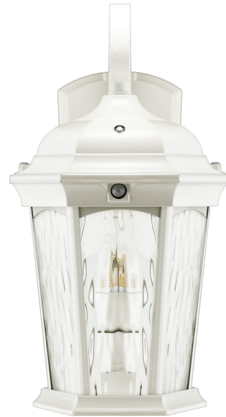
Integrated LED Fixture

*Note: Design, features and specifications subject to change without notice. Some features may not be available on all models. For more information please visit: www.eurilighting.com or call 1-888-743-5766